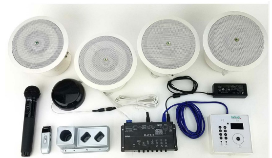
Bottom image©TeachLogic LLC All rights acknowledged.