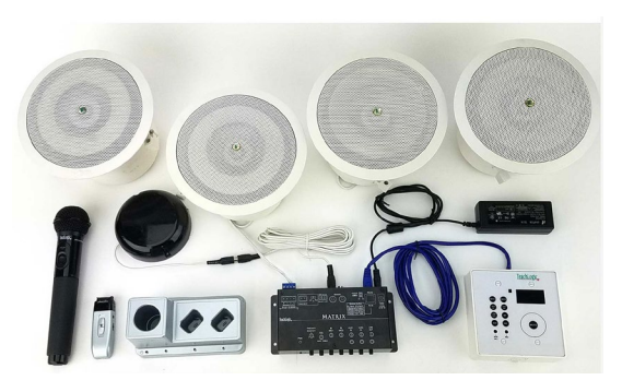
Bottom image