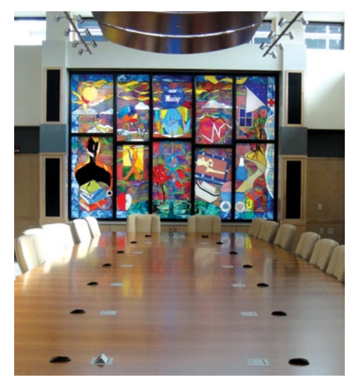
Boardroom, Unity Health Systems, Rochester, NY

In addition to meeting today's technology needs (and planning for those twenty years from now), we are also acutely sensitive to the architectural aesthetic of a project. The key is continual coordination of other systems that are or may be affected by technology systems' pathways and spaces.